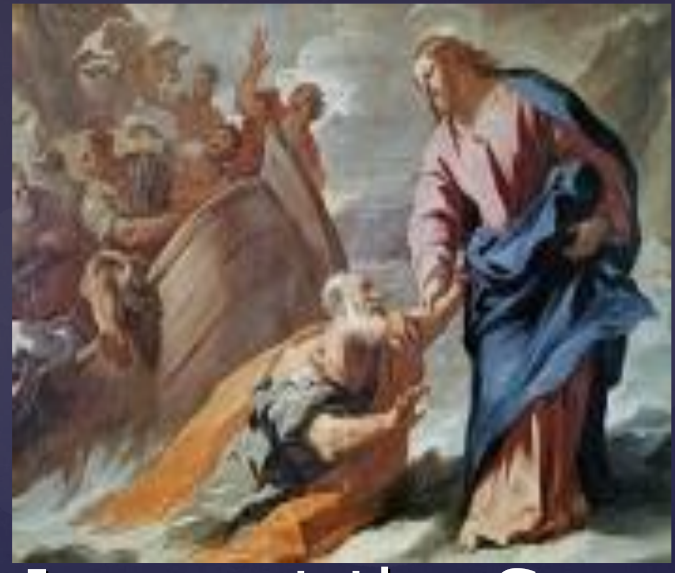
Jesus at the Sea